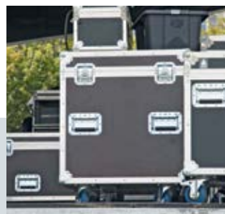
Events and stage construction