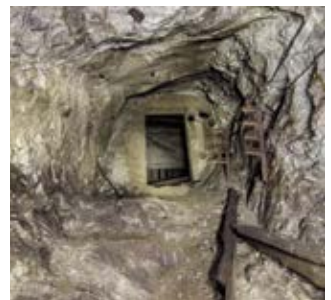
Structural steelwork and mining